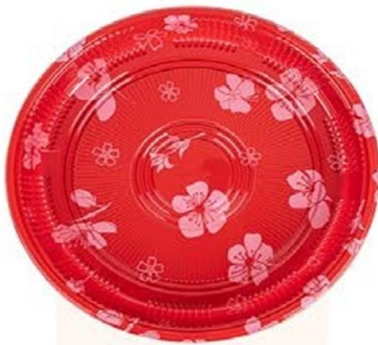
繁花似锦 Blooming Flowers A