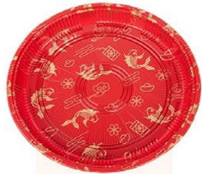
锦鲤纳福 Koi Carp Brings Good Luck C