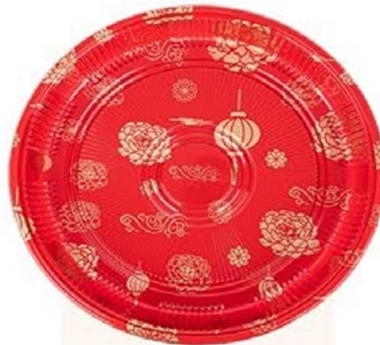
花开富贵 Flowers in full bloom B